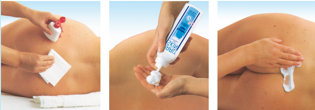
Figure 1: • Clean the skin with soap and water and dry thoroughly.

MARLY SKIN® is applied to the skin area in need of protection which should be dry and free of grease.