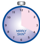
Figure 3: • Apply a thin layer of MARLY SKIN® to the skin surface in need of protection and rub in well. Depending on the size of the application area, repeat as necessary. • Let dry for three minutes after applying. The skin is now protected for four to six hours even if the skin is washed with soap and water or disinfected several times throughout. All natural functions such as perspiration, respiration, and sense of touch are unaffected during this time.

MARLY SKIN® is neither visible nor otherwise noticeable. It is perfectly harmless when it comes in contact with the eyes, mouth or food and leaves no marks behind.